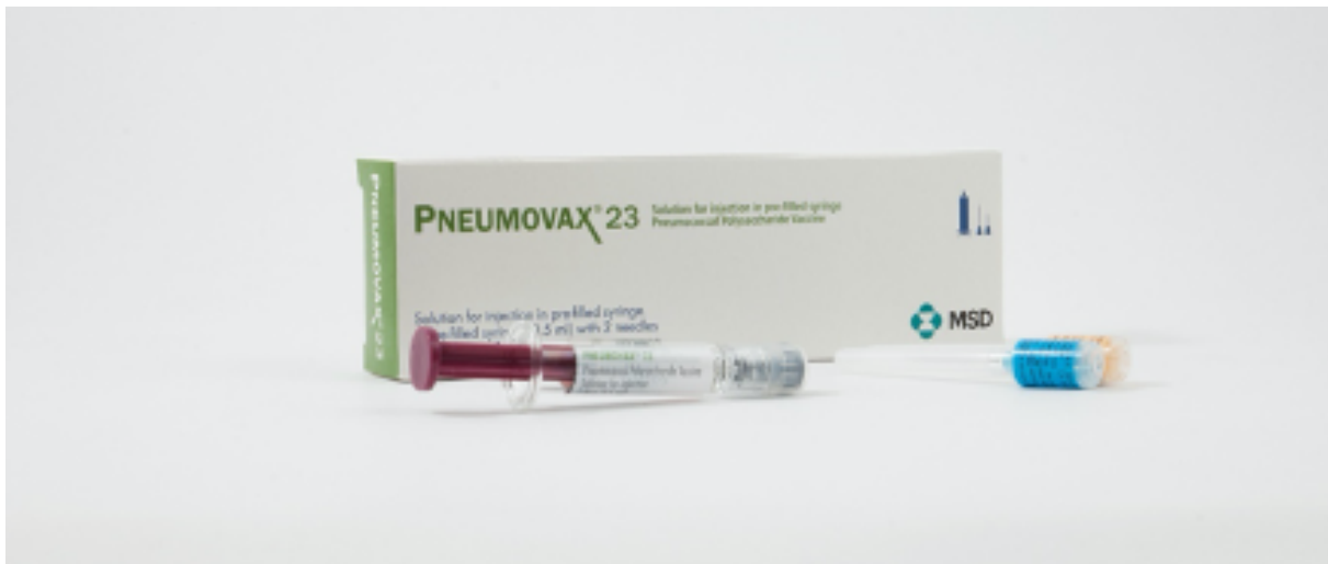
Image shows PNEUMOVAX ® 23 pre-filled syringe presentation (PFS) of PPV

MSD is transitioning to pre-filled syringe presentation (PFS) of PPV under the brand name PNEUMOVAX ® 23 which will replace all future supply of vials from May 2020. Vials will continue to be available intermittently until May 2020. A combination of growing global demand for pneumococcal polysaccharide vaccines, alongside manufacturing constraints, have led to regular interruptions in supply of PPV to the UK since 2017. The introduction of a PFS presentation of PPV is intended to support the continuity of supply and to help address public health need.